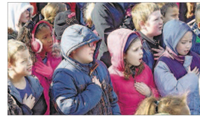
South Heights Elementary students sing the national anthem Wednesday during the announcement ceremony for the Kids' Zone.

An early investment in children pays dividends as they grow into productive adults.